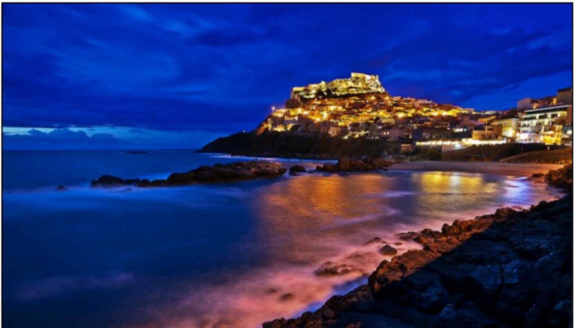
Castelsardo at dusk

There are some beautiful churches in town, a highlight being the Santa Maria delle Grazie, and lots of little walkways and alleys to explore.