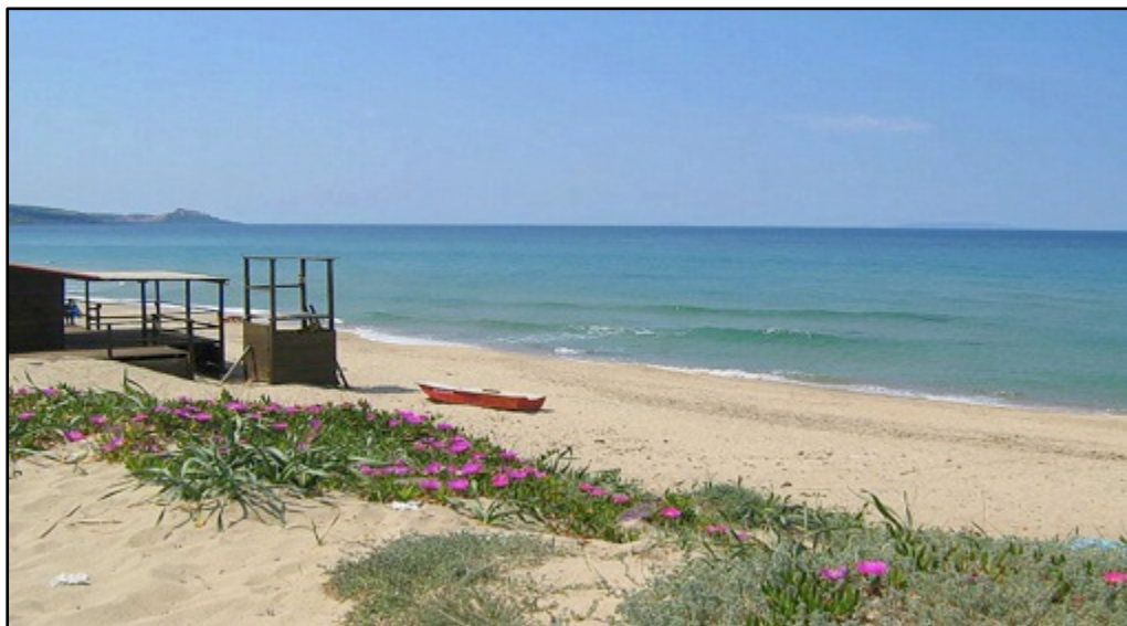
San Pietro a Mare beach

The Castello Doria dating back to the 12th century in the beautiful traditional village of Chiaramonti is also worth visiting. It rises at the beginning of the road that leads to Perfugas and offers a sweeping view over an impressive panorama.