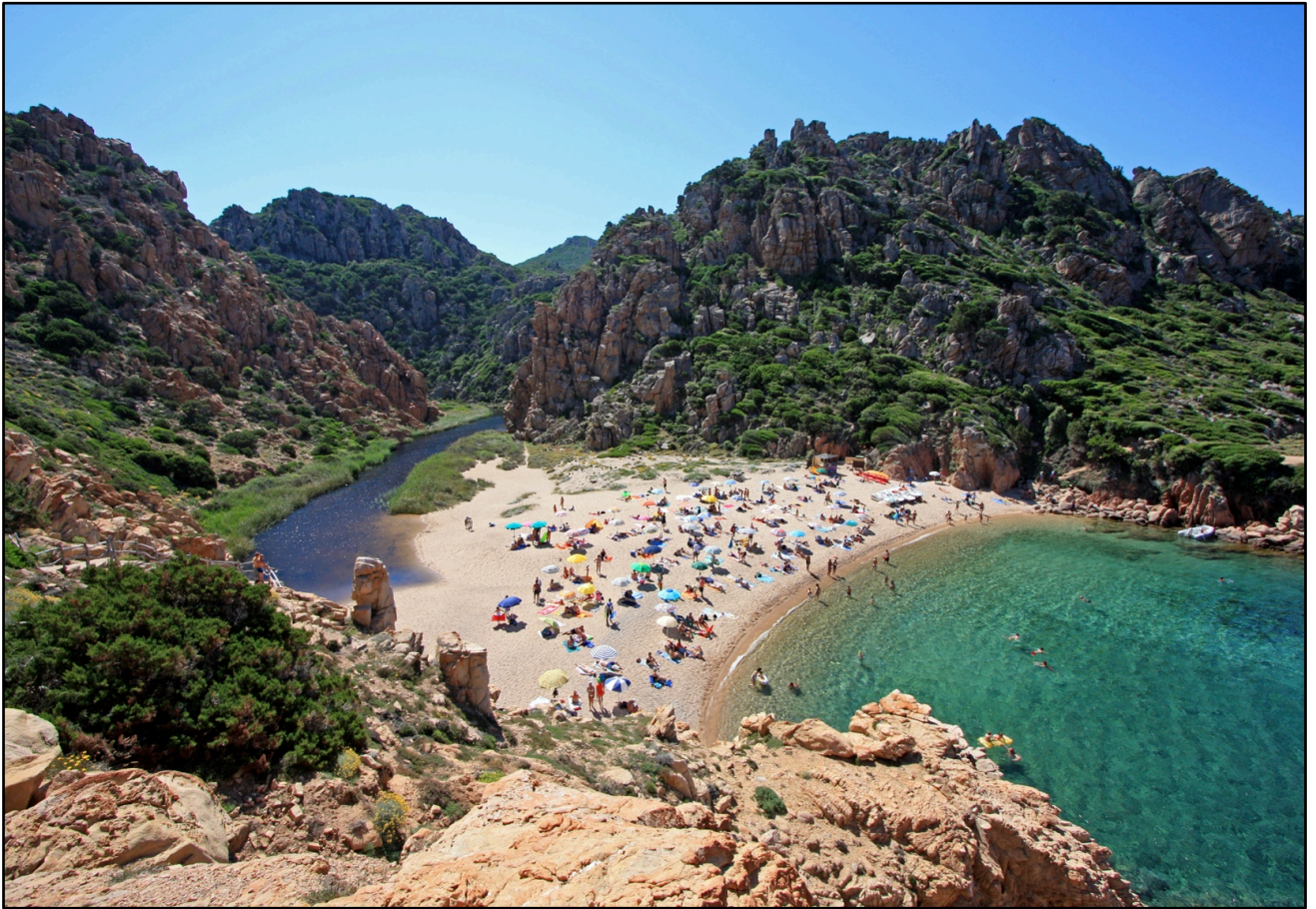
Li Cossi Beach, Costa Paradiso